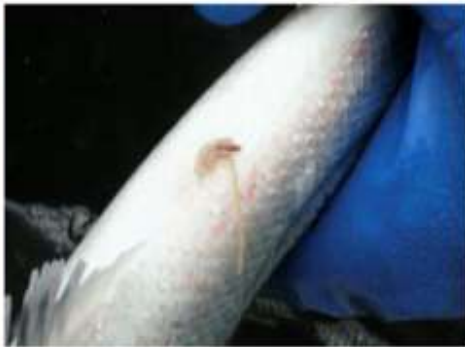
Inntil 64 millioner kroner utlyses nå for å øke kunnskapsgrunnlaget for forebygging og kontroll av lus i lakseoppdrett.