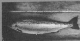
Mowi salmon, Flogøy, Norway 1971