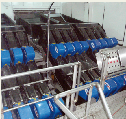
SI-5 is supplied by Stranda Prolog AS.

Start by taking a look at the direction of fish coming out of the stunning machine to assess their condition and the need for «help». It is also possible to observe stunning and stabbing and assess the