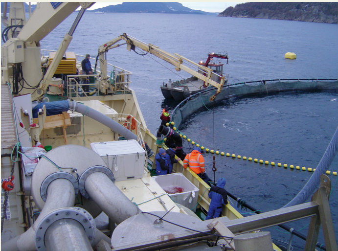
Harvesting at the net-side.

More research is being carried out on the subject of «dead-haul» and quality under the auspices of the FHF Action Plan Salmon programme.