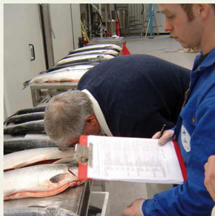
Quality Control.

Less than 24 hours pre-rigor time for ice stored fish after percussive stunning shows that fish have been exposed to handling stress. The normal pre-rigor