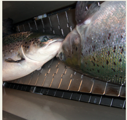
An electric stunner from Sotra Maskin Produkter AS.

Sotra Maskin Produkter launched its Singelbedøver (Single stunner) in May 2005. As the name implies, this technology stuns fish one at a time. The procedure is traditional and this technology uses both landing and pumping via pipes directly to a straining box and then into an electrified groove. The actual stunner consists of two half grooves. When the fish touches both sides, it