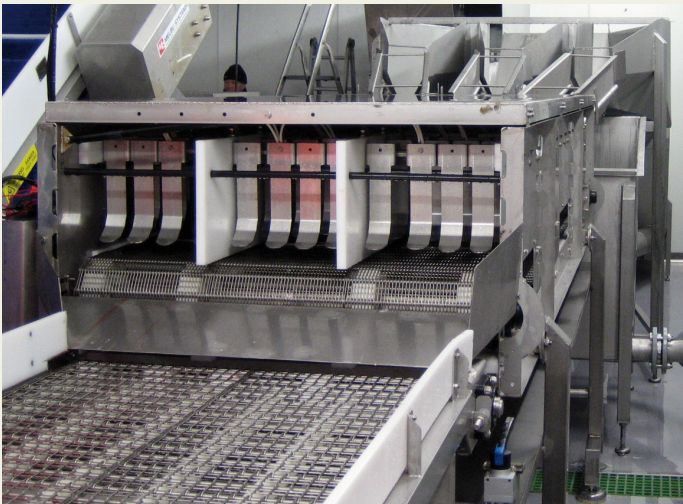
An electric stunner from Seaside AS.

zontal metal netting conveyor belt, which makes up one pole of the electrical circuit, over which are suspended 10 rows of 4–5 lateral metal slats, forming the other pole of the circuit. The slats are hinged individually and ensure contact with the fish regardless of its size. The conveyor belt is narrow enough to prevent normal sized salmon lying crosswise; a position which experience shows increases the risk of