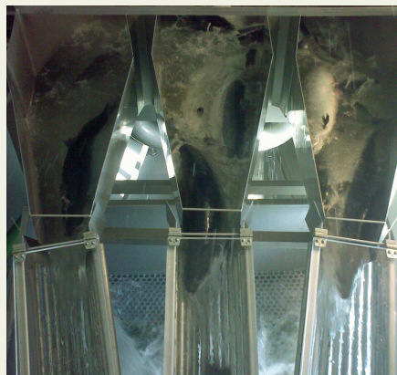
One way aligning fish, developed by Melbu Systems AS.

This system is based on exploiting normal behavioural responses whereby fish actively try to leave a dark vat towards the flow of water (and light) and thus end up in the groove that takes them to the percussive stunning machine. If fish are under stress, they will not line up properly. They may swim calmly around the inlet and must be forced in the di-