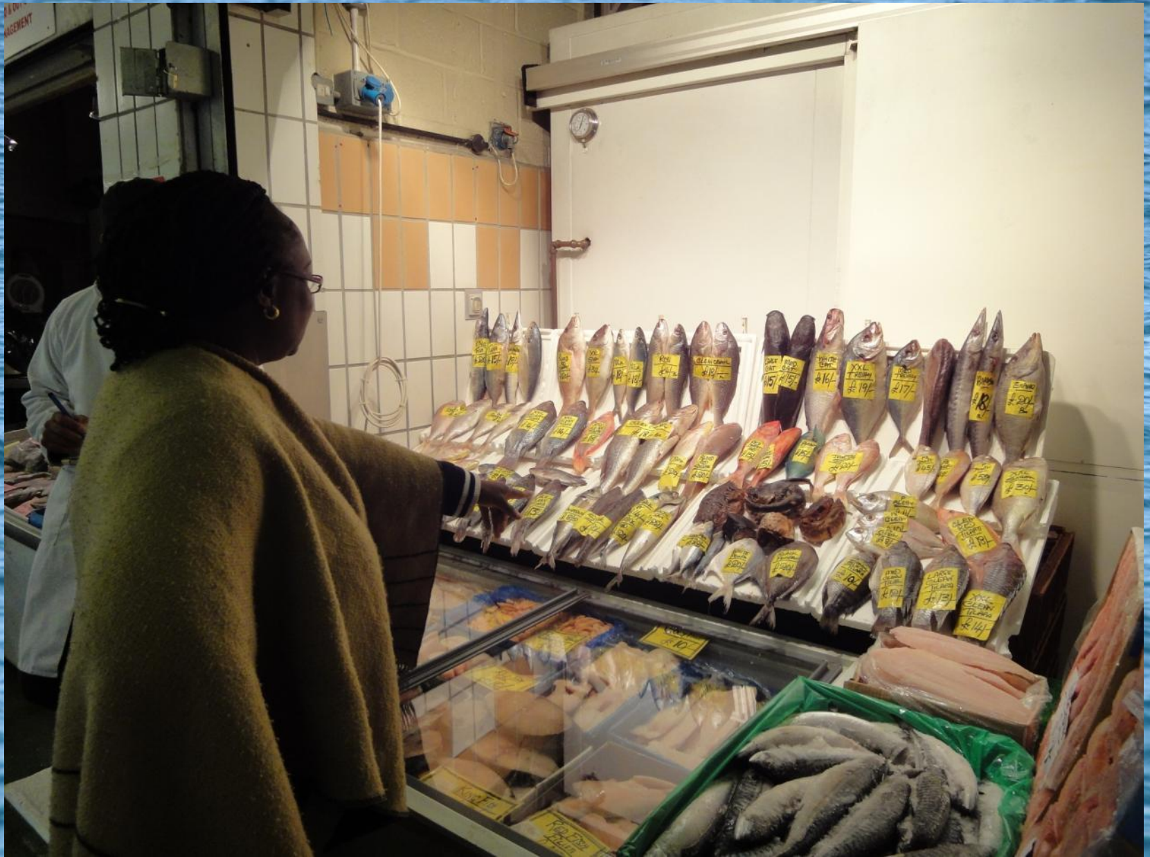
Billingsgate wholesale market, London