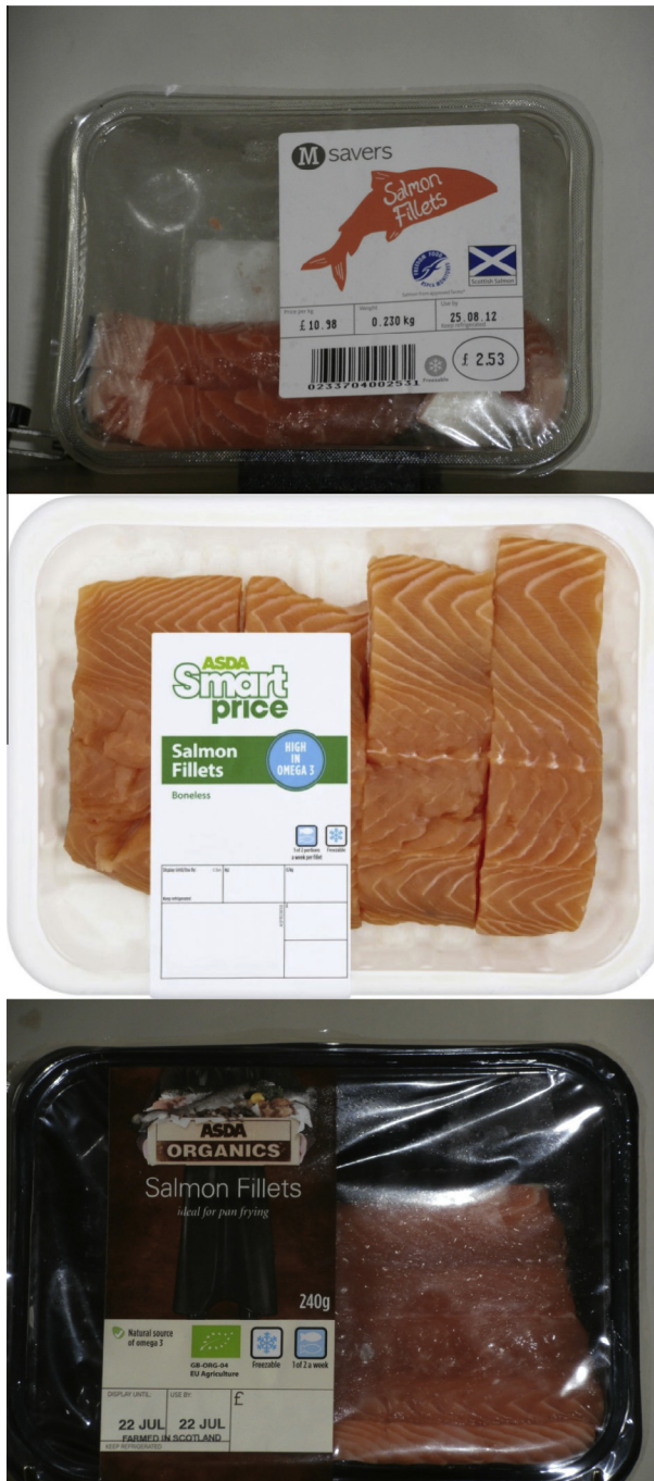
Fig. A2. Fresh salmon fillets. The top image is from Morrisons with a Scottish label in the lower right corner of the main section of the product label. The bottom two images are both from ASDA, one unlabeled (middle) and one with an organic label (bottom).

The role of eco-labels in private provision of public goods is still not well understood. When consumers can choose an impure public good that jointly produces a private good and an environmental public good, welfare can increase or decrease, depending on the responsiveness of consumers to the environmental attribute (Kotchen, 2006). Understanding consumer demand for eco-labels thus is an important step in evaluating the overall potential for markets to provide public goods. Our analysis provides one important piece of this puzzle by illustrating the importance of retailer