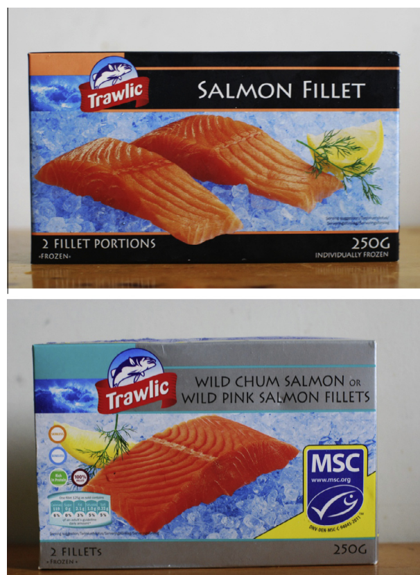
Fig. A1. Frozen salmon fillets. Packages containing two frozen fillet portions from the retailer Lidl's own brand Trawlic. The top is an unlabeled product, while the bottom carries the MSC label in the lower right corner.

Questions about how eco-label premiums are transmitted through the supply chain to the actors who ultimately affect sustainability (fishermen, fish farmers, and fishery managers) highlight a key limitation of the attribute-based approach to price premiums, namely lack of quantity data. Because we do not observe quantities sold, we do not know whether high- or low-premium pricing strategies move more eco-labeled product. Suppose that the high-end retailers sell most of the MSC-labeled salmon and that low-end retailers sell little. Because high-end retailers have the lowest premiums, then the average premium passed through to the harvest sector will be low. The opposite would be true if the low-end retailers sell most of the MSC-labeled salmon. The Alaskan salmon industry's decision would seem most consistent with the former. It could even be the case that retail pricing strategies deliberately discourage the purchase of eco-labeled products; simply including these products in stores and not necessarily selling them would then be part of projecting a positive corporate socially responsible image.